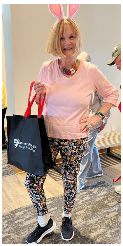
Seniors enjoyed the 2024 Adult Easter Hunt.

Happy New Year. Welcome to 2025! We hope the new year brings you everything you wish for and more. Whether you're looking to pick up a new skill, try a fun activity, or