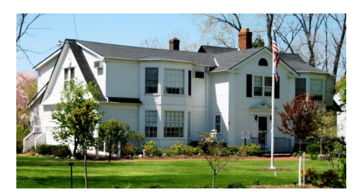
The Bennett-Van Curen Historical House