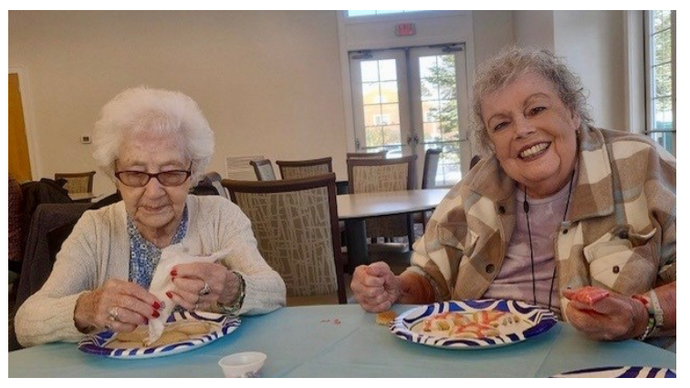
Cookie Decorating Class 2024.

We are also thrilled to announce the return of our Senior Appreciation Luncheon on March 28 from 12:00 to 2:00 P. This event is our way of showing appreciation to all of you who support our programs throughout the year. Enjoy great food, music, and conversation with friends-old and new! Registration for the luncheon will begin on February 10 for residents of Mayfield Village and will remain open until full. Starting February 24, registration will be available to seniors