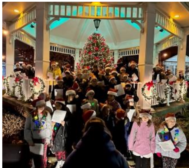
The annual tree lighting ceremony was well-attended this year as students from Center School sang carols.

These are just some of the many great events and memories of 2023 in Mayfield Village. I look forward to being part of many more great memories in 2024.