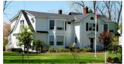
The Bennett-Van Curen Historical House