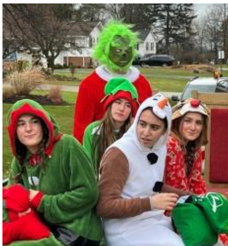
(Left) The Grinch traveling on Santa's Float, along with many cold and wet elves. (Right) Sitting on Santa's lap was a thrill for many of our youngest residents.