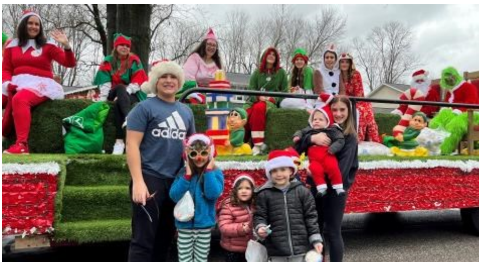
Many families waited for Santa's float to come down their street and came outside to greet him.