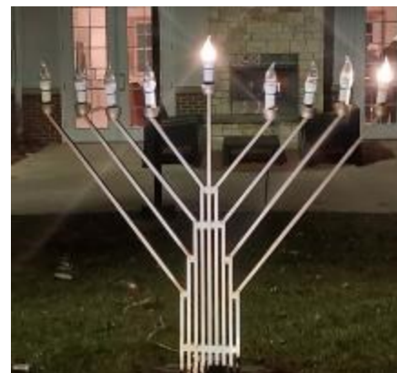
The Kindling of the Menorah was celebrated on December 7.