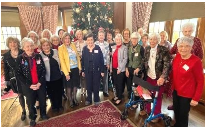
Garden Club members at their annual holiday party at Mayfield Country Club.

The Mayfield Village Garden Club is thinking spring. Plans are being made for the Annual Mother's Pancake Breakfast and Plant Sale on May 12. The Club members are also thinking about the November 2024 Craft Show. Watch for the advertisements for these two wonderful events. Proceeds from these events are