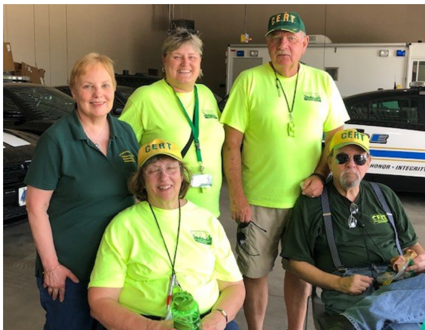
K-9 Officer Leo provided demonstrations during the Open House and members of the Community Emergency Response Team (CERT) were on hand to answer questions about their activities.