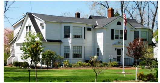
The Bennett-Van Curen Historical House

For additional information, call 440-461-0055 or visit our website at mayfieldtownshiphistoricsociety@yahoo.com . Tours of the Museum are available by appointment.