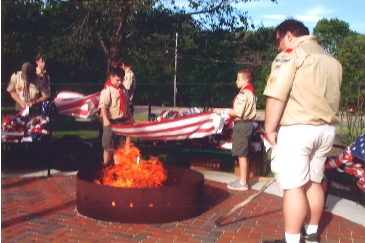
Boy Scout Troop 289 performed the Flag Day Ceremony on June 14, retiring approximately 1400 flags. This was the first year the ceremony was held at the new First Responders Memorial, located next to the Fire Station.