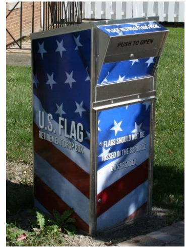
Flag drop box at the Civic Center parking lot.

The Mayfield Women's Club would like to thank everyone for their donations of distressed Flags. This year's Flag Day Ceremony was performed again by Scout Troop 289. The number of flags retired was about 1400. Please continue to bring old, worn and tattered United States flags to the Civic Center for proper disposal. The drop box is located in the rear of the parking lot near Heinen's.