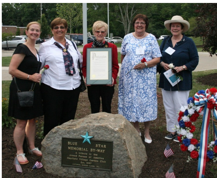
Members of the Garden Club of Ohio participated in the Blue Star Marker Dedication Ceremony.