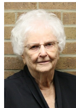
Patsy Mills Council , Ward 2