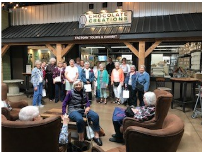
The seniors outside of Chocolate Creations during the May trip to Hartville.

2019 Trips. We went to Hartville in May where we shopped at the giant Hardware, the Hartville Market-