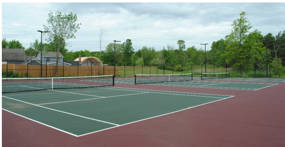
Above, the new tennis/pickleball courts located off SOM Center Road behind the new softball parking lot. Below, new recreational signage at Parkview and SOM.