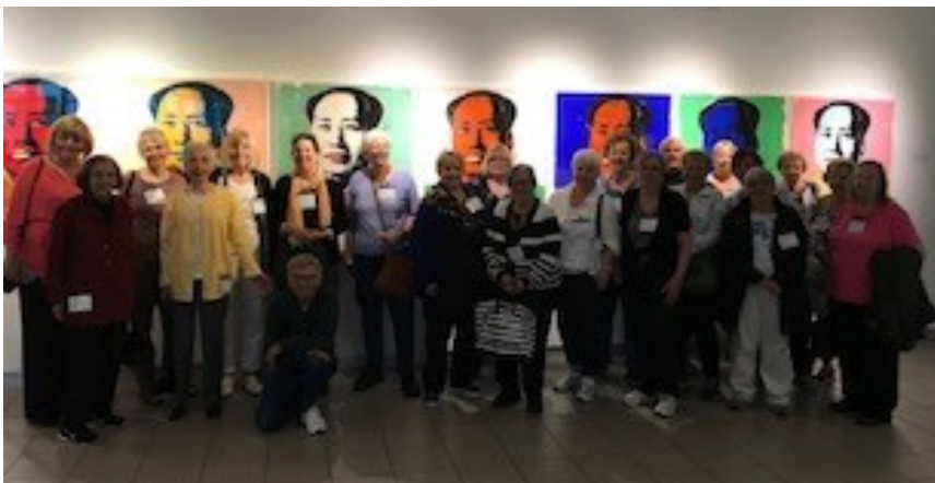
The seniors in front of one of the art exhibits at Progressive Insurance during our guided tour in June.

place and Flea Market, and—the highlight of our trip—Chocolate Creations. We heard an interesting presentation on the history of chocolate, sampled delectable chocolate—and received the chocolate bar which we designed along with a bag of chocolate! Then in June, we went to Progressive Insurance where we took a guided tour to see the artwork at the main campus. The art is “to promote conversation and for education.” It was a very interesting tour.