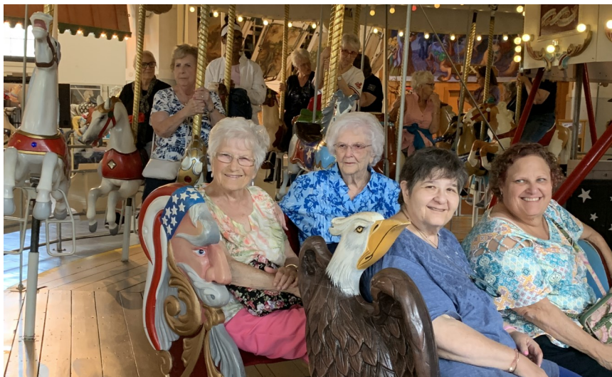
Seniors aboard the carousel at the Merry-go-Round Museum.

Later that month, we went to Wooster to see the magnificent performance of “South Pacific.” By the time you receive this publication, we will have also traveled to the Merry-go-Round and Milan Museums in Sandusky and to Kingwood Gardens in Mansfield. Call to get on the waiting lists for the August trip aboard the Goodtime III and the September trip to Chautauqua.