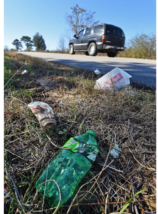
Help eliminate roadside litter by following the tips found at the website of America the Beautiful. ( https://kab.org/ )

We all have an obligation to take care of our world, be it through litter prevention and control, recycling of products, reuse of the products we have, or simply eliminating the purchase of products where applicable. Thank you for caring!