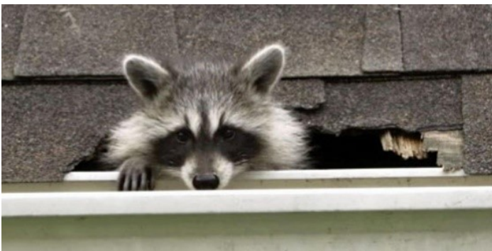
A nuisance animal is one that has invaded your living space. Only nuisance animals will be trapped by the Animal Warden.

This means the Animal Warden will come out to trap raccoons that have moved into your attic. It does not mean that the animal warden will come out to trap a squirrel or a chipmunk that is digging in your garden or a skunk that is walking in your backyard. The Animal Warden will provide assistance in these situations by coming out to talk to you about ways to deal with whatever animal issue you might be having. Trapping, however, must be limited to animals that have invaded your home or taken up residence in your yard (i.e., under your deck or shed).