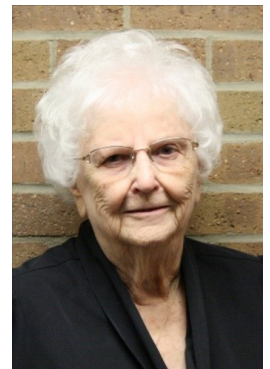
Patsy Mills Council, Ward 2

This fall, remember to rake your leaves to the tree lawn not into the street. It is easier for the Service Department to pick the leaves up from the grassy areas.