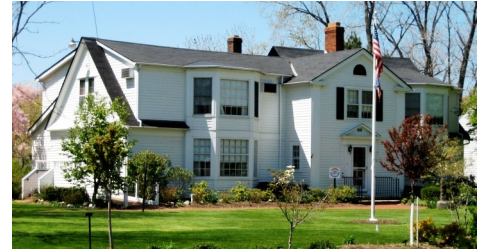
The Bennett-Van Curen Historical House

Please join us at one of our upcoming events, all open to the public. Follow us on Facebook for the latest updates. All events are located at the Mayfield Village Community Room, 6621 Wilson Mills Rd., unless noted otherwise. Call for more information or if you need a ride to the meetings. 440-461-0055.