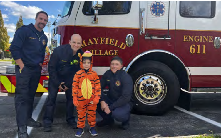
The Fire Engine was an exciting part of the Trick-or-Treat Trail. Below, some of the students from the Mayfield High School Interact Club that volunteered to help with fun activities along the Trail.

Another reminder, as those leaves continue to fall, please make sure the leaves are gathered on the tree lawn and not on the street to help avoid any potential accidents with traffic and residents. Our diligent and hard-working service department will continue to collect those leaves, as they travel through their continuous route, until we see snow.