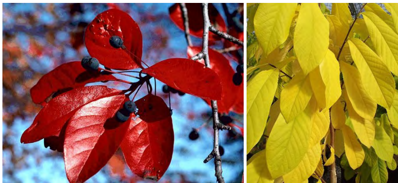
Native plants that provide beautiful fall colors include Black gum (red) & Paw Paw (yellow).