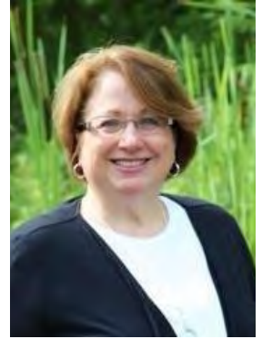
Mayor Brenda T. Bodnar