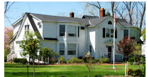
The Bennett-Van Curen Historical House