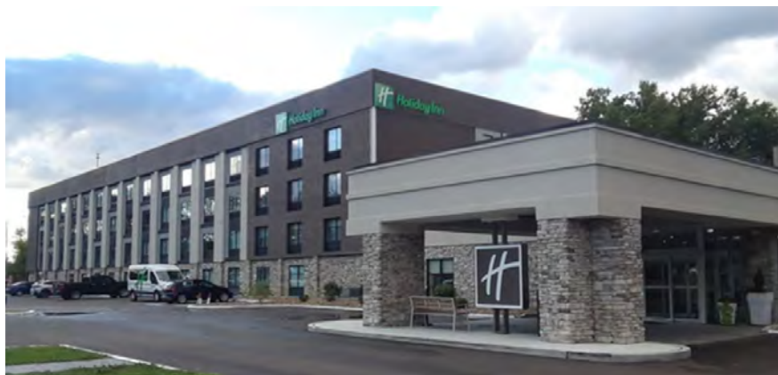
The updated look of the Holiday Inn.